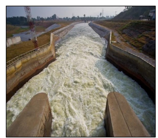
Figure 5.7: Erosion protection at Nam Theun 2, Lao People's Democratic Republic

Increased sediment load in the river can extend a long way downstream and can smother aquatic vegetation and habitats. This can be particularly problematic where gravel beds provide important habitat for downstream fisheries. More turbid water can also encourage fish to move to cleaner parts of the river. If sediment levels are very high, this can result in the smothering of aquatic invertebrates and can coat the gills of the fish causing death. Where significant erosion risks are likely, protection measures will be required (Figure 5.7).