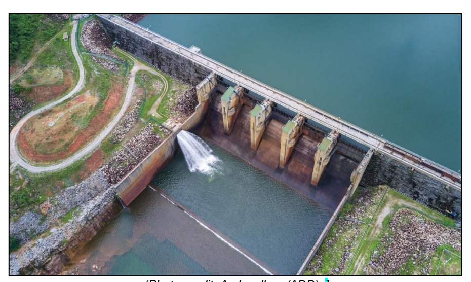
Figure 5.5: Dam at Nam Theun 2, Lao People's Democratic Republic, with downstream flow provision.

Changes to a river's hydrological regime can negatively impact its aquatic ecosystem and can disrupt important ecological processes. The health and integrity of a river system will usually depend on a range of high, medium, and low flows. Most rivers experience natural annual low flows which reduce connectivity and limit species migration. This may be positive for native species which can often outcompete invasive species that have not adapted to low flows. So, maintaining low flows at their natural timing and level can maintain the abundance and survival rate of native species (Figure 5.5). Medium or base level flows will usually occur during most of the year. These flows maintain the hydrogeomorphology of a river which, in turn, maintains habitat, temperature, and dissolved oxygen levels to support aquatic species. Short high flow events are also important to prevent vegetation from encroaching on river channels and to move sediment and organic matter downstream. High flows can also reduce water temperature and increase dissolved oxygen, which can trigger ecological processes such as spawning and migration. Consequently, river flows altered by a hydropower project can lead to a reduction in health and integrity of the river system<sup>19</sup>.