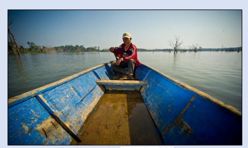
Figure 5.6: Reservoir at Nam Theun 2, Lao PDR, showing trees remaining

As such, in many contexts' removal of trees over a certain size is selected as the best compromise.